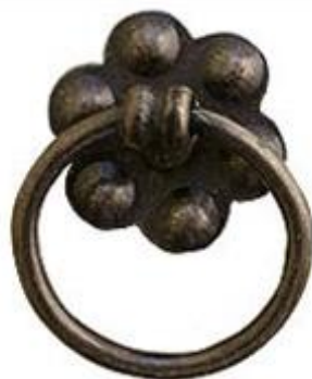
1063 / Flower / 28mm