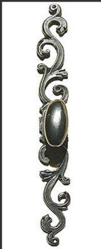
1030 / Small Ornate 178mm (178mm C-C)