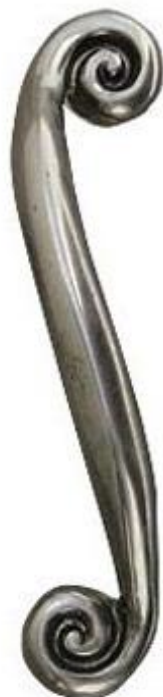
1035 / Modern Range / Left handle 115mm (96mm C-C)