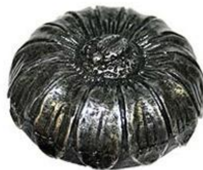
1050 / Flower / 42mm