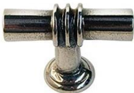
1091 / Scaffold pull / 40mm

Products available in Antique Brass (AB), Pewter Zinc (PZ), Antique Nickel (AN), Brushed Nickel (BN), Bright Nickel (BRN) & Dark Antique Brown (DAB)