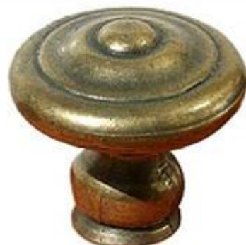
1001 / French / 34mm