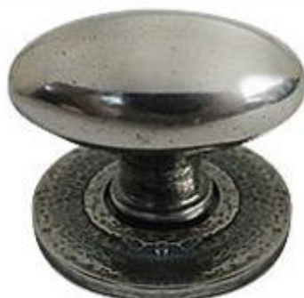
1003 / Oval / 36mm