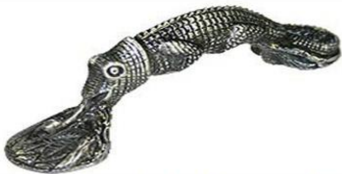
1047 / Chameleon handle / 145mm (96mm C-C)