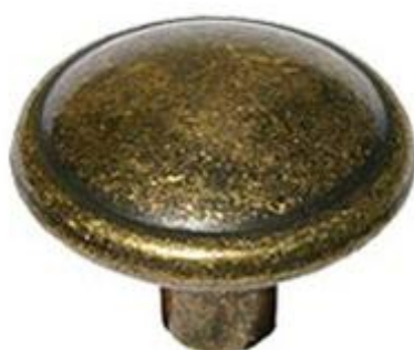
1009 / Small / 30mm