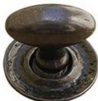
1027 / OvalS / 32mm