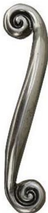
1036 / Modern Range / Right handle 115mm (96mm C-C)