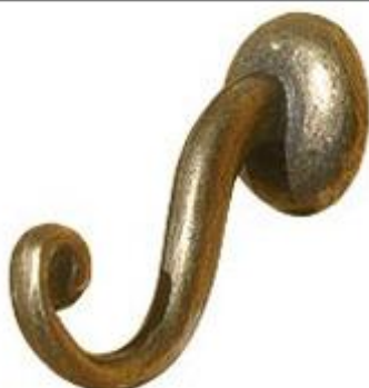
1060 / Small coat hook / 22mm