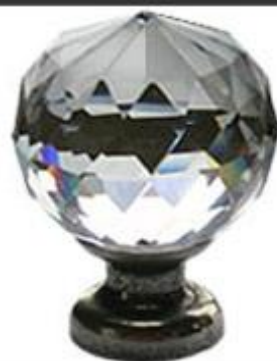
1073 / Crystal 40mm