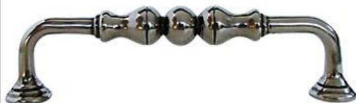
1005 / Fixed French / 145mm (128mm C-C)

Products available in Antique Brass (AB), Pewter Zinc (PZ), Antique Nickel (AN), Brushed Nickel (BN), Bright Nickel (BRN) & Dark Antique Brown (DAB)