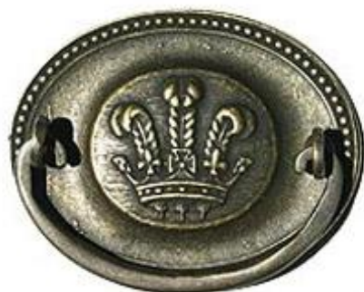
1065 / Antique crest 75mm (64mm C-C)