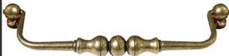
1012 / Large French / 160mm (180mm C-C)