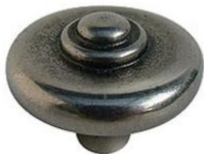
1068 / Punto / 35mm