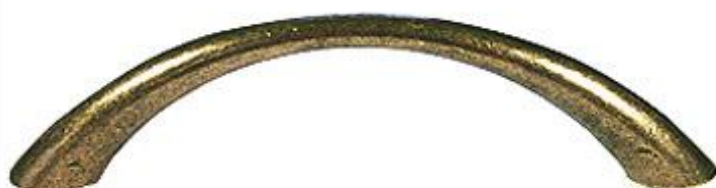
1013 / Fixed whalebone / 110mm (96mm C-C)