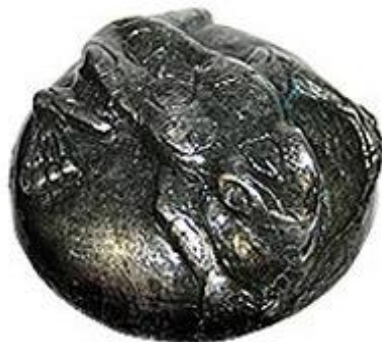
1052 / Frog knob / 42mm