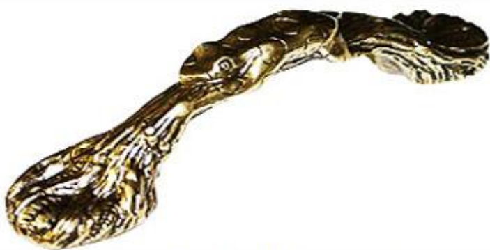
1048 / Frog handle / 145mm (96mm C-C)