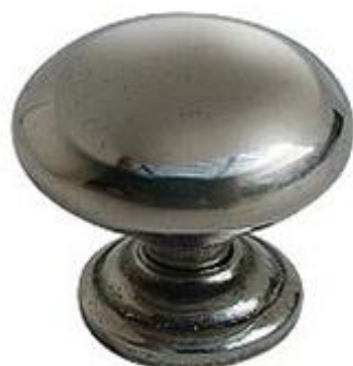
1080 / Cuppola / 32mm