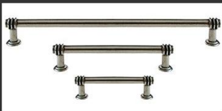
1086 / Extended Scaffold / 300mm (288mm C-C)