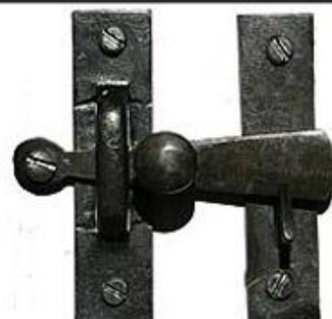
1062 / Latch handle 62mm (38mm C-C)