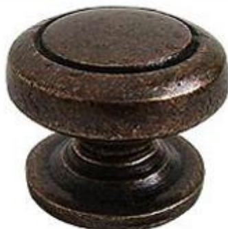
1021 / ButtonM / 20mm