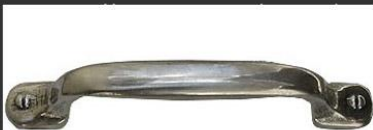
1037 / False screw handle / 135mm (96mm C-C)