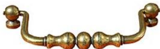
1011 / Small French / 112mm (122mm C-C)