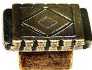
1017 / Diagonal / 38mm