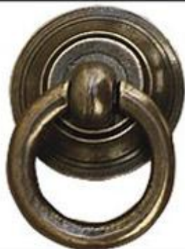
1034 / Raised / 44mm