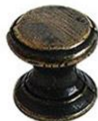
1019 / ButtonS / 12mm