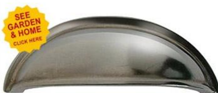
1071 / Hidden Screw / 91mm (78mm C-C)