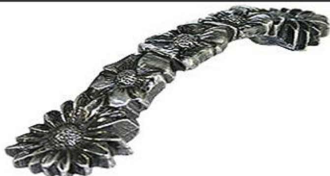
1046 / Flower handle / 148mm (96mm C-C)