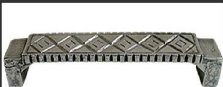
1016 / Diagonal handle / 133mm (125mm C-C)