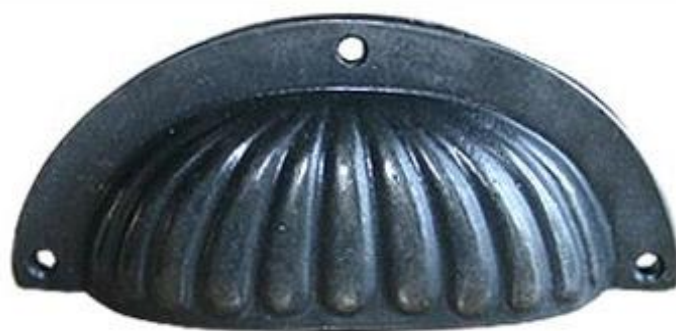
1028 / Shell / 90mm (83mm C-C)