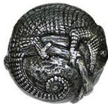
1051 / Chameleon / 42mm