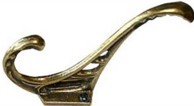
1008 / Antique Coat Hook / 138mm