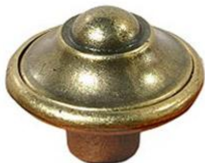
1002 / Hollow / 34mm