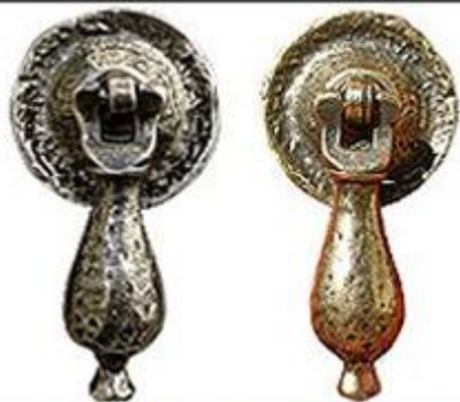
1010 / Dropper handle / 68mm