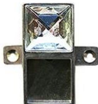
1074 / Crystal Recess / 70mm (60mm C-C)