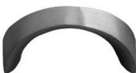
1055 / Oval arch / 51mm (47mm C-C)