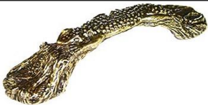
1045 / Gecko handle / 148mm (96mm C-C)