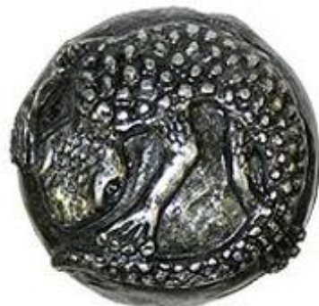
1049 / Gecko knob / 42mm