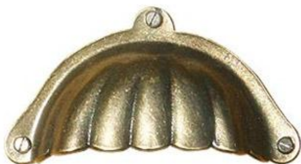
1025 / Scalloped / 94mm (86mm C-C)