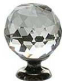
1072 / Crystal 30mm