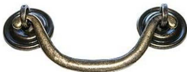
1044 / Drop Handle Small / 80MM (68MM C-C)