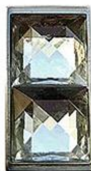
1076 / Crystal Decorative plate 70mm (60mm C-C)