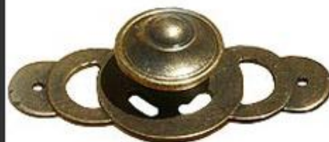
1042 / Ornate backplate 103mm (86mm C-C)

Please note that the Backplates do not come with knobs. Mix and match the knobs of your choice to create a winning combination