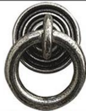
1006 / Target / 34mm