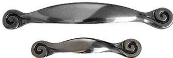
1066 / Spiral strap handle / 160mm (96mm C-C) 1083 / Mini spiral / 105mm (42mm C-C)