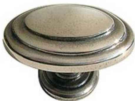
1094 / Knob Saturn / 52mm