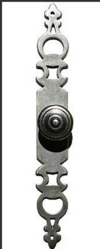
1067 / Caprice backplate 243mm (222mm C-C)