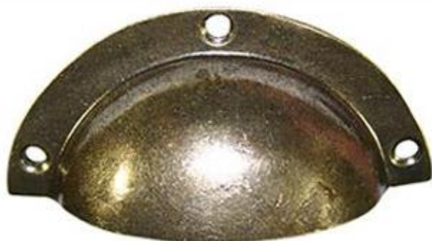
1014 / Cup three screw / 83mm (74mm C-C)