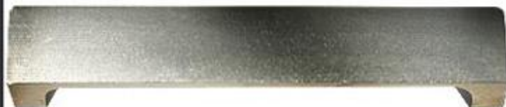
1069 / Square rod handle / 130mm (124mm C-C)