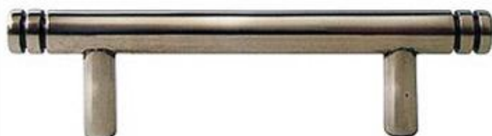
1084 / Handle cylinder / 100mm (65mm C-C)