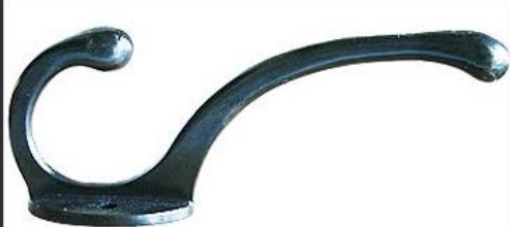
1054 / Plain Coat Hook / 129mm