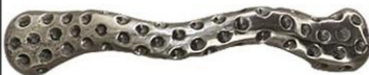
1023 / Stippled handle / 138mm (96mm C-C)